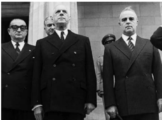
Figure 10.1 President Charles De Gaulle of France met with Greek Prime Minister Constantine Karamanlis in Athens, on May 16, 1963. The visit was part of an effort to divert Greece's exclusive relationship with the NATO powers

electoral law did so even more. The true benefit of the 1956 elections, however, was reaped by the Left which broke out from its ostracism and was legitimized in its partnership with the center forces. Henceforth the Left would merge its own rhetoric with the anti-right parlance of the liberals. 6